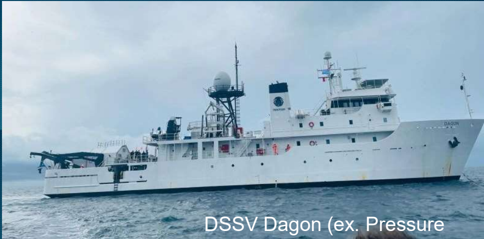
DSSV Dagon (ex. Pressure Drop)